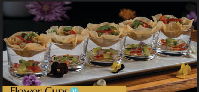
Flower Cups V

Delicious every bite. Add flavor with peanut sauce and cucumber salad—flavorful, Tender and juicy chicken.