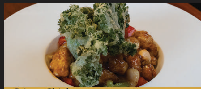
Crispy Chicken 19

Grilled baby pork ribs marinated in house honey and spice BBQ sauce with Thai coleslaw