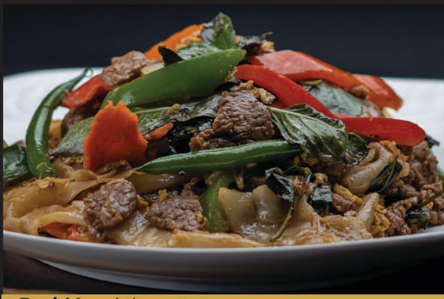
Pad Kee Mao V G Spicy

In-house soy sauce, stir-fried wide rice noodles, egg, Chinese broccoli, and carrot. Choice - Chicken, Pork, Tofu, Veggie, Beef +2, Shrimp +2, Seafood +4