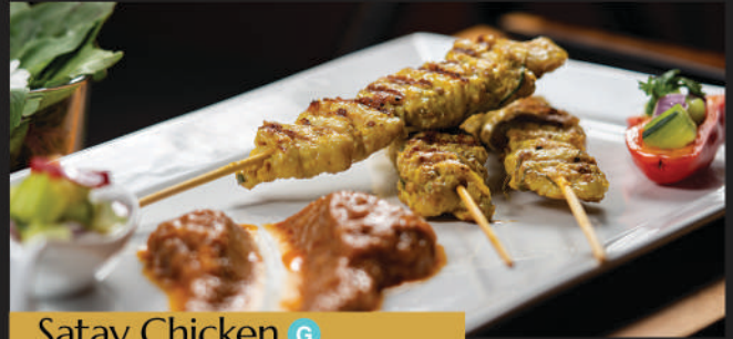
Satay Chicken G

No.1 on the list, everyone will like this - crispy, tasty, easy to eat with your HAND.