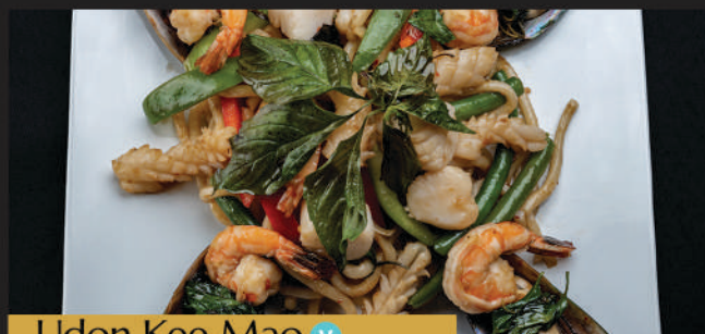
Udon Kee Mao V

The more spicy, the more yummy Japanese noodles go so well with Thai basil.