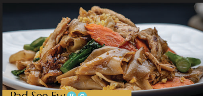
Pad See Ew V G

Savory and tasty, it is so simple yet delicious. Adding more flavor by adding our jalapeno peppers in vinegar and chili flakes.