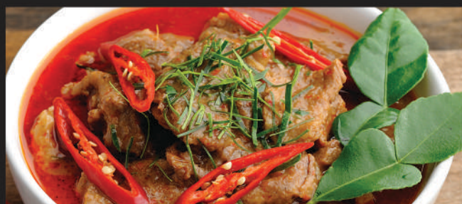
Wagyu Beef Panang Curry G 24

Pan-seared salmon fillet in Japanese Sake and soy sauce, caramelized onions, and sautéed mixed vegetables served on a Clay food warmer.