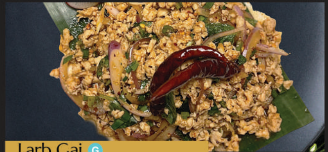
Larb Gai G

The best curry for pineapple lovers: Cook fresh-cut pineapple in authentic red curry, sweet and savory with fresh ingredients.