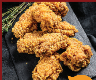
5 WINGS WITH SAUCE $12