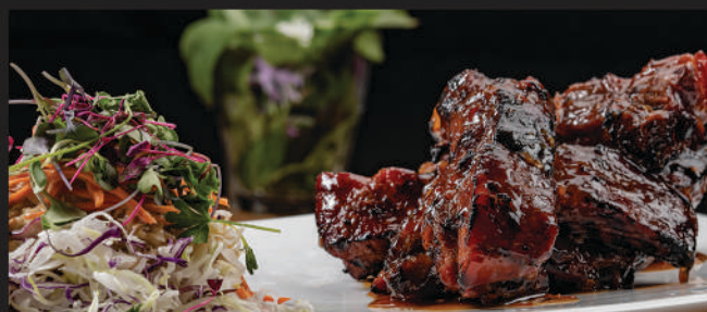
Cashew Ribs 20

Grilled marinated Wagyu Beef steak in homemade sauce. Served with our signature spicy lime juice and salad.