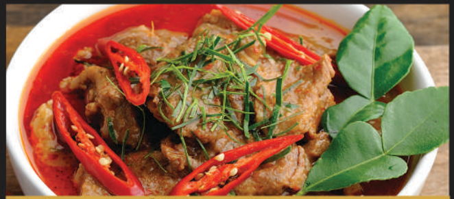
Wagyu Beef Panang Curry G

Stir-fried wide rice noodles, onion, bell pepper, green bean, basil, and egg with spicy garlic and basil sauce. Choice - Chicken, Pork, Tofu, Veggie, Beef +$2, Shrimp +2, Seafood +$4