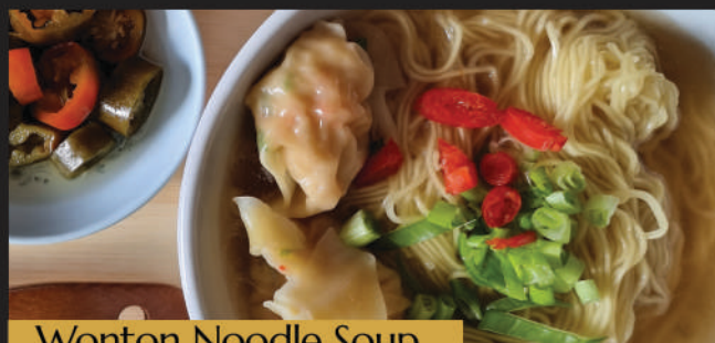
Wonton Noodle Soup

Spicy and sour noodle soup in clear broth infused with herbs and spice! Try to make your flavor with our hot sauces.