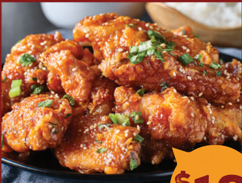
9 WINGS WITH SAUCE