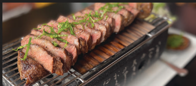
Crying Tiger ( Wagyu Seak 6 oz) G 26

Skirt Steak, Wagyu Beef Panang Curry A classic, much-loved Thai curry, the thick, rich, luscious, flavourful sauce comes in soft and tender BeefGulasch style.