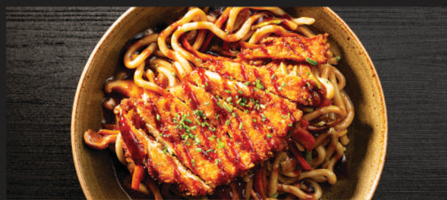
Katsu Noodle with Dark Sauce

Homemade chicken Katsu and choice of noodles in savory, sweet, and a little sour dark sauce. The trendy Thai street food that is perfect for all weather.