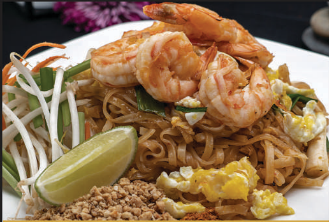
Pad Thai V G