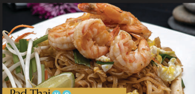
Pad Thai V G

Our Pad Thai sauce has an authentic flavor, made with real tamarind juice, Thai fish sauce, and palm sugar.