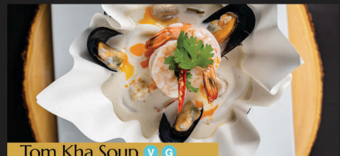
Tom Kha Soup V G

Iconic, Creative, And Unique in both presentation and flavor! It will be a fantastic pic on your IG.