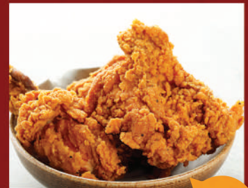
3 WINGS WITH SAUCE $8