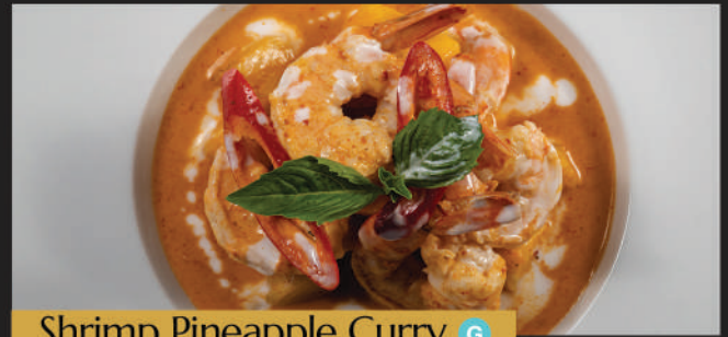
Shrimp Pineapple Curry G

The most popular item, Curry with Katsu - Dipping the crunchy and yummy chicken Katsu into homemade curry is AMAZING!