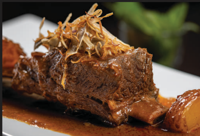
Massaman Short Ribs G 30

Rich, tasty, creamy, and packed with uncompromising flavor from several aromatics and spices. Combines boiled and fried noodles in a coconut curry broth.