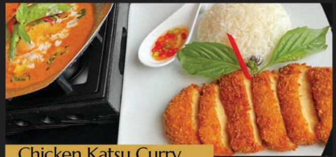
Chicken Katsu Curry

The most popular item, Curry with Katsu - Dipping the crunchy and yummy chicken Katsu into homemade curry is AMAZING!