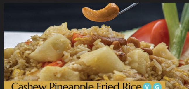
Cashew Pineapple Fried Rice V G

Cashew pineapple fried rice is suitable for everyone, as it has the sweetness and sourness of fresh-cut pineapple. It's so amazing!