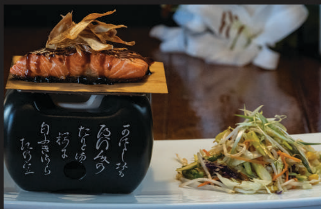
Salmon Sake Onions G 24

Chef Tip's original and "Signature Dish" beef short rib simmered in aromatic spices and coconut milk with cashew nuts and potatoes.