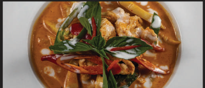
Red Curry G V Medium Spicy

Stir-fried rice with meat, egg, pineapple, carrot, onion, green peas, cashew nuts, tomato, cucumber, cilantro, and curry powder. Choice - Chicken and Shrimp, Tofu,