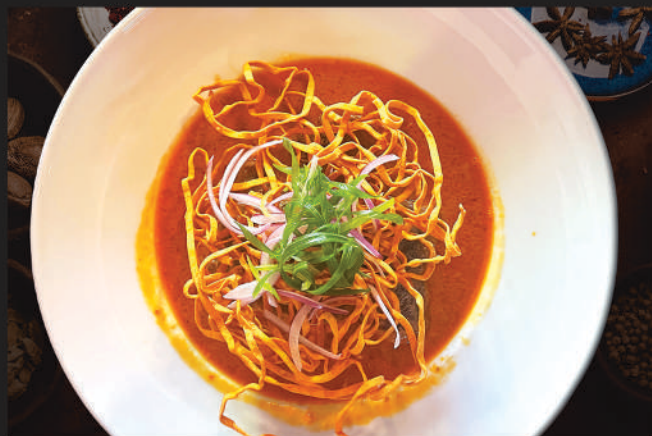
Short Ribs Khao Soi G 30

Rich, tasty, creamy, and packed with uncompromising flavor from several aromatics and spices. Combines boiled and fried noodles in a coconut curry broth.