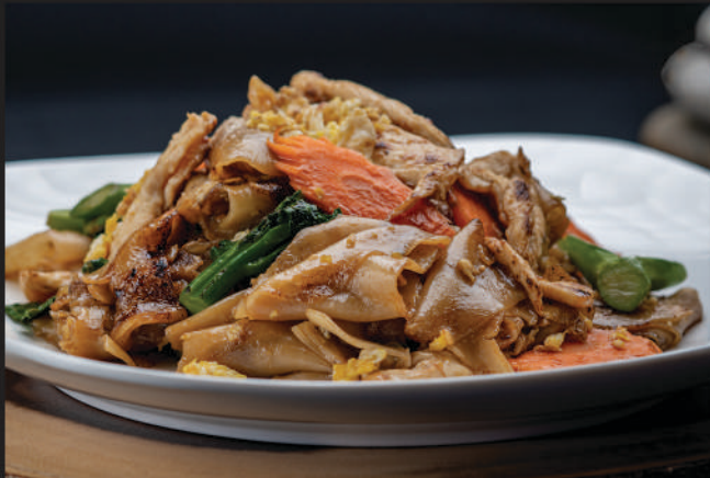
Pad See Ew G V

Stir-fried rice noodles with egg, bean sprouts, scallions, and crushed peanuts in an authentic sauce made with fish sauce, tamarind, and palm sugar. Choice - Chicken, Pork, Tofu, Veggie, Beef +$2, Shrimp +2, Seafood +$4