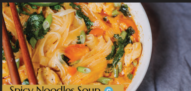
Spicy Noodles Soup G

Homemade chicken Katsu and choice of noodles in savory, sweet, and a little sour dark sauce. The trendy Thai street food that is perfect for all weather.