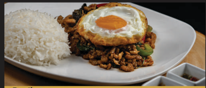
Basil V G Spicy

Bamboo shoots, long chili peppers, sweet Thai basil, and coconut milk. Choice - Chicken, Pork, Tofu, Veggie, Beef +4, Shrimp +2, Seafood +4,