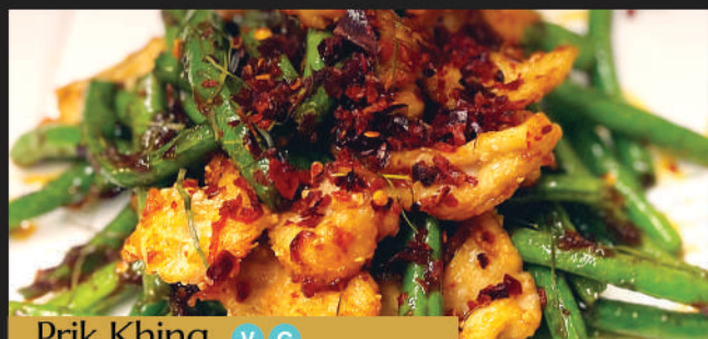
Prik Khing V G

If you love garlic, go for it; fried garlic on top is a plus! Order with a fried egg for the traditional