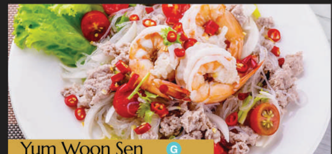
Yum Woon Sen G

We all love classic Thai street food: steamed glass noodles with fresh lime and chili dressing. It's a low-calorie meal that is best for dinner.