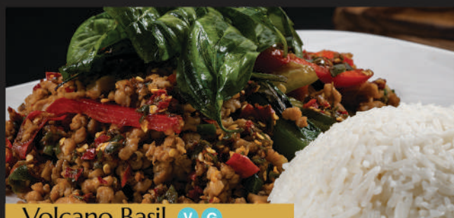
Volcano Basil V G

Choice - Chicken, Pork, Tofu, Veggie, Beef +$2, Shrimp+2, Seafood +$4