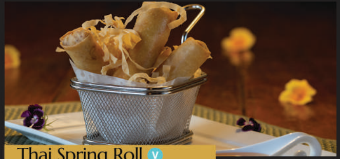
Thai Spring Roll V

Deep-fried Tofu served with sweet chili sauce. 16