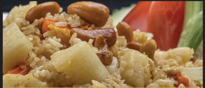
Cashew Pineapple Fried Rice G V

Skirt Steak, Wagyu Beef Panang Curry A classic, much-loved Thai curry, the thick, rich, luscious, flavourful sauce comes in soft and tender Beef Gulasch style.