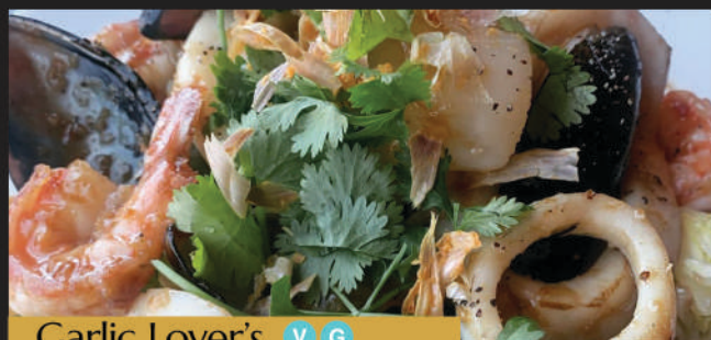
Garlic Lover's V G

It's so spicy but too good that you keep eating! Fresh garlic and chili boost up all the flavor.